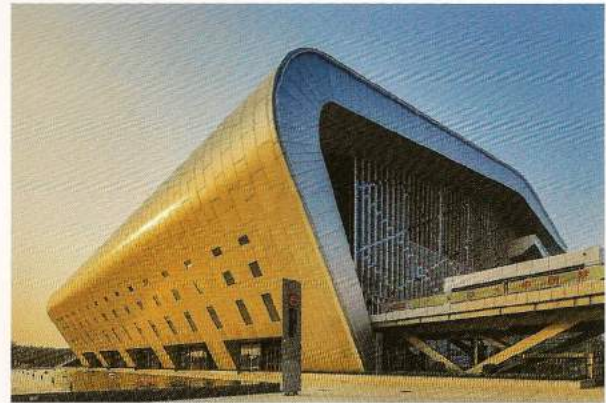
Comprehensive Training Stadium

Xuzhou Olympic Center is 9 miles away from downtown. The center covers an area of 117 acres, and the gross floor area is 240,000 square meters, including one 35,000-seat stadium, 2000-seat comprehensive training stadium, 2500-seat natatorium and 36,000-square-meter ball game stadium.