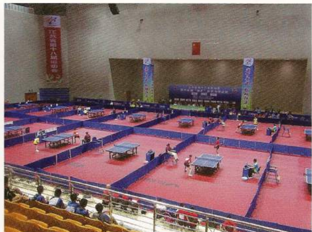
Competition venue of the competition venues of WIC 2018