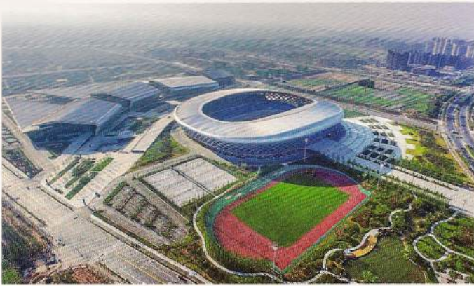
Xuzhou Olympic Center