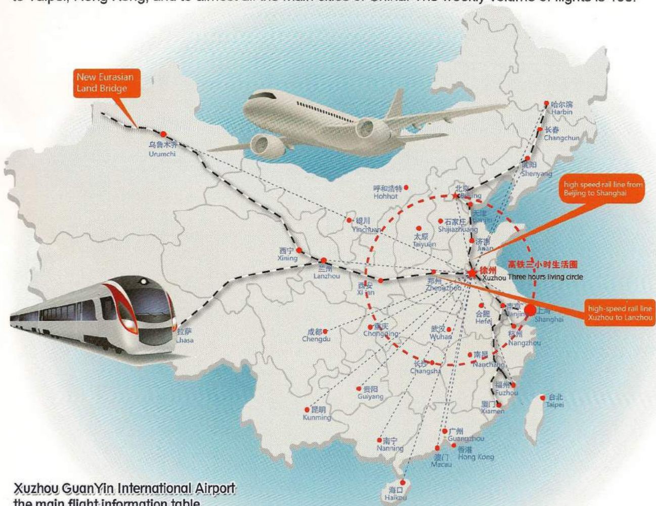
Xuzhou GuanYin International Airport the main flight information table

Xuzhou Guanyin Airport is national A-class port, which has more than 20 flights. Now, Xuzhou has flights to Taipei, Hong Kong, and to almost all the main cities of China. The weekly volume of flights is 105.